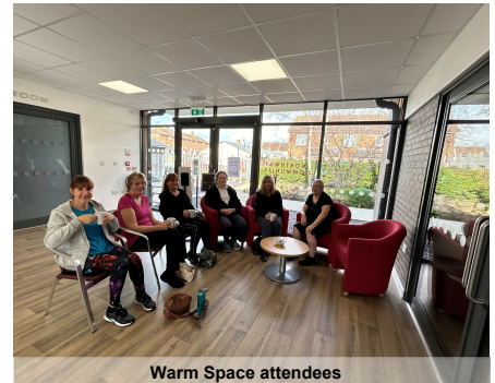
Warm Space attendees