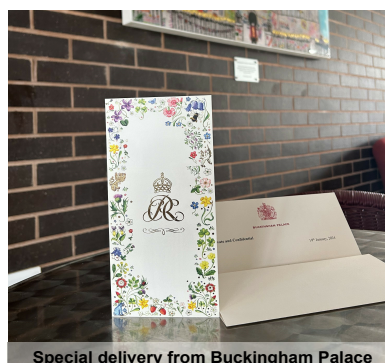
Special delivery from Buckingham Palace

Northway Community Hub is once again running a Warm Space every Monday and Tuesday from 10am - 2pm.