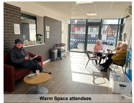
Warm Space attendees